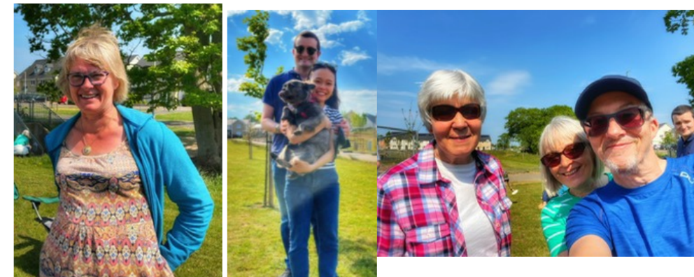
Summer Gather on the Green - Sunday 9 July 2-4pm